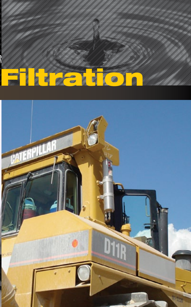
FTA fuel filtration units are used both in static and on-board applications