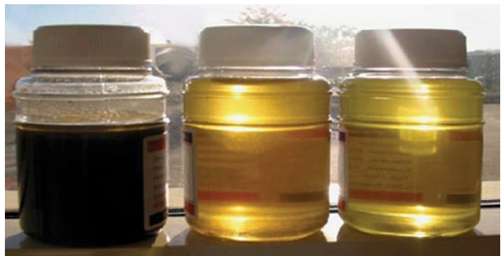
Left - Right Oil entering the filter unit; oil after 8 hrs filtering; filtered oil re-entering the fryer