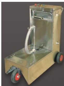
FF4000 Mobile cooking oil recycling unit