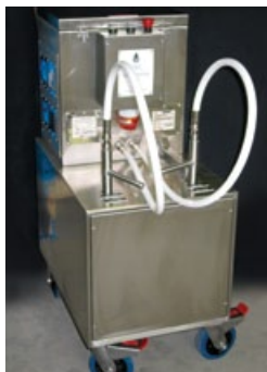
FF3000 Mobile cooking oil recycling unit