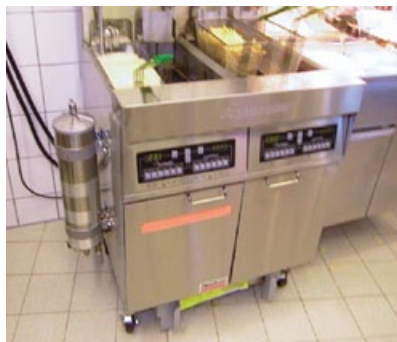
FF1020 Fixed cooking oil recycling unit