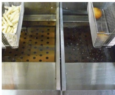
Filtered oil (left) compared with prefiltered oil