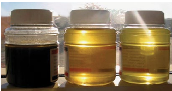
Left - Right Oil entering the filter unit; oil after 8 hrs filtering; filtered oil re-entering the fryer