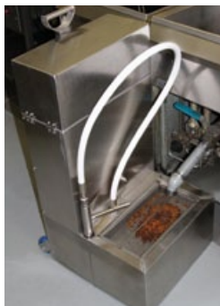
FF1500 Mobile cooking oil recycling unit