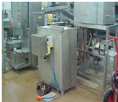
FF40446 Bulk cooking oil recycling unit